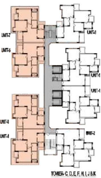
TYPE D -995

2 Bedrooms + 2 Toilets | Carpet Area = 55.20 SQM (594.17 SQFT.) Balcony Area = 8.14 SQM (87.61 SQFT.) Area Under External Walls, Columns & Shafts = 7.28 SQM. (78.36 SQFT.) | Common Area = 21.82 SQM. (234.86 SQFT.)