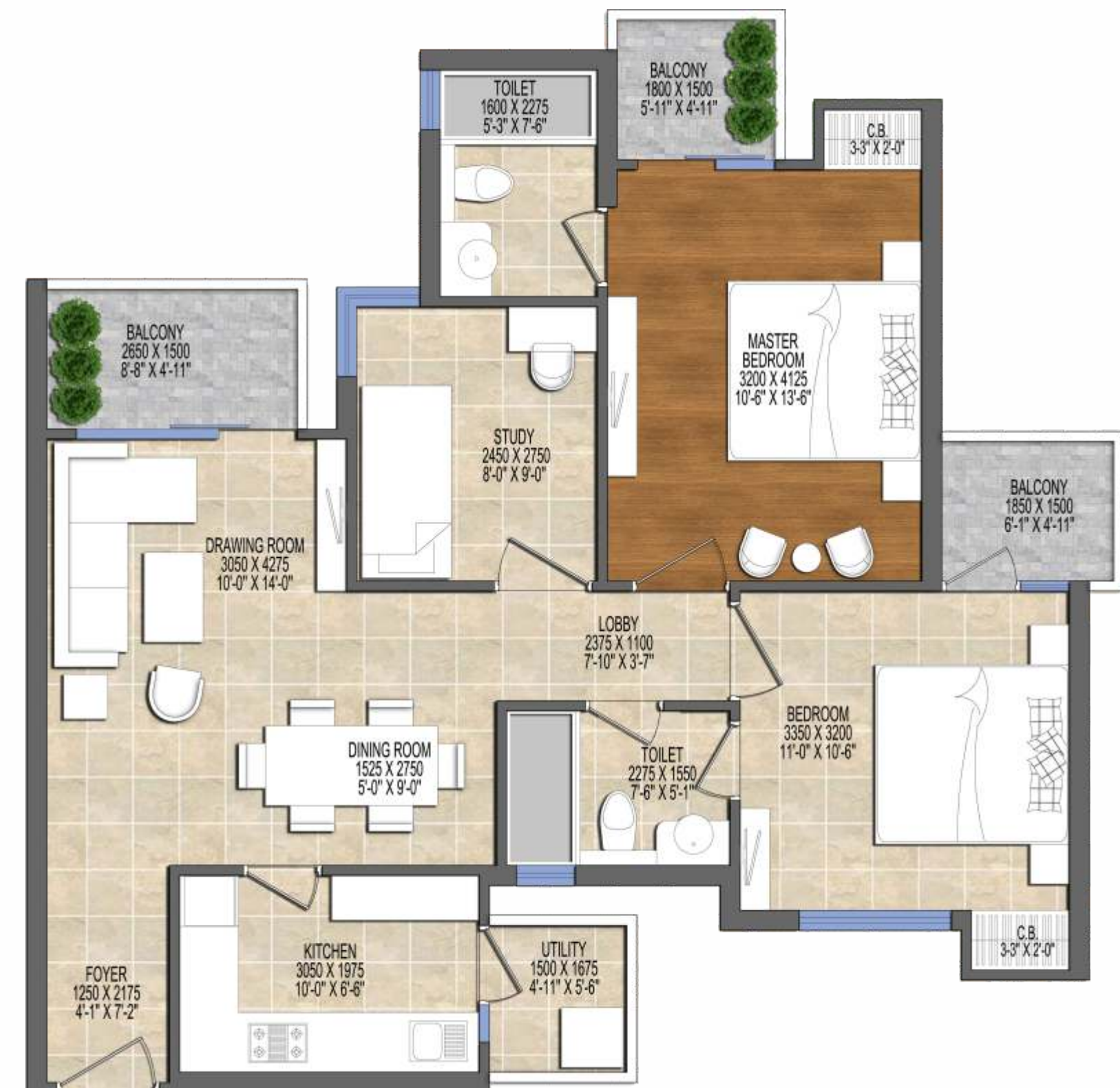
TYPE B -1245

3 Bedrooms + 2 Toilets | Carpet area- 84.31 SQM. (907.51 SQFT.) Balcony area- 17.32 SQM. (186.43 SQFT.) Area Under External Walls, Columns & Shafts = 8.68 SQM. (93.43 SQFT.) | Common Area = 32.77 SQM. (352.63 SQFT.)