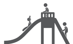
Childrens' Play Area