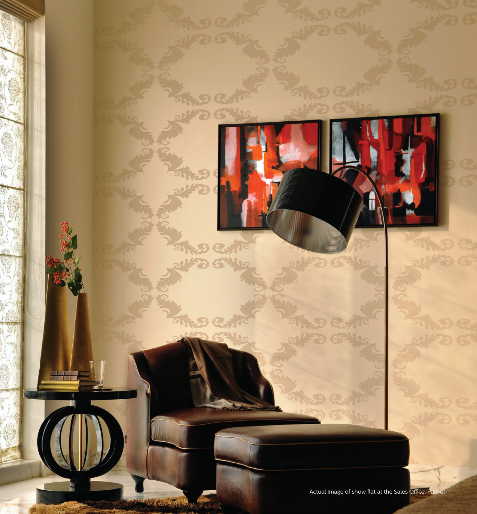
Actual Image of show flat at the Sales Office, Panvel

h hiranandani communities a niranjan hiranandani initiative