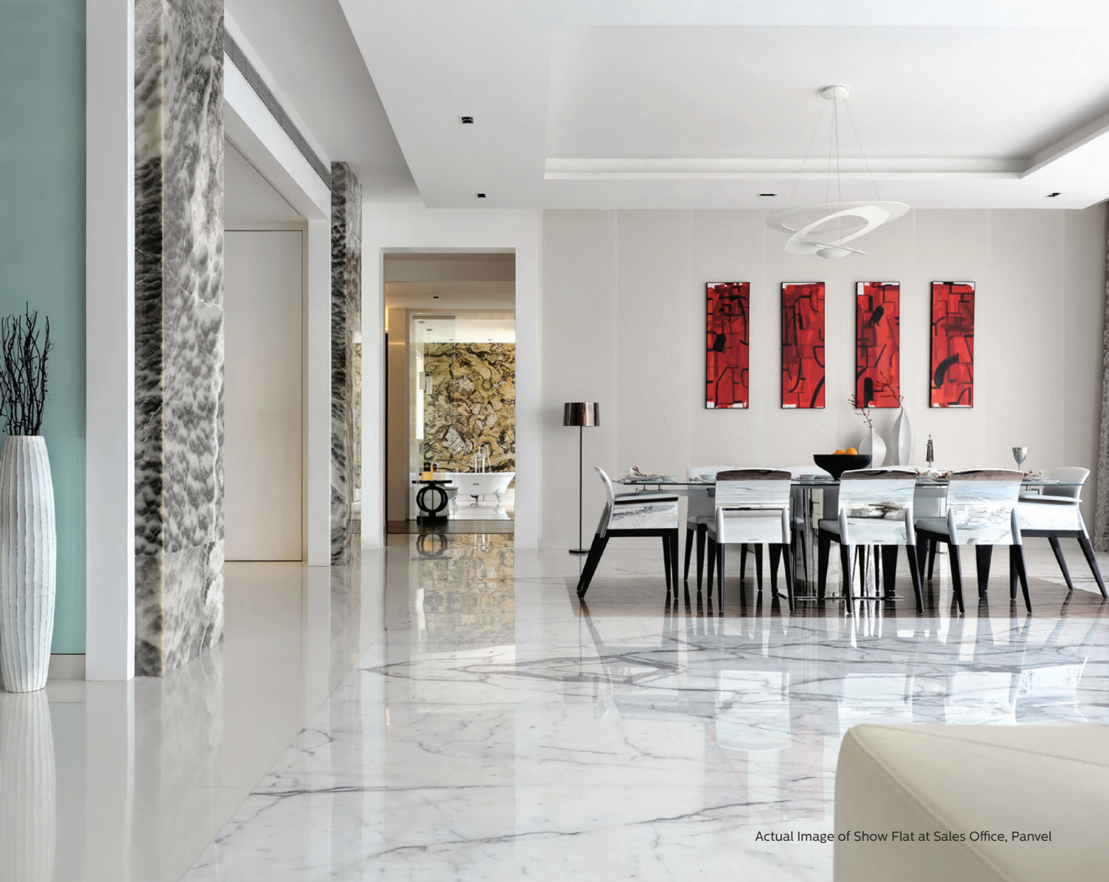
Actual Image of Show Flat at Sales Office, Panvel