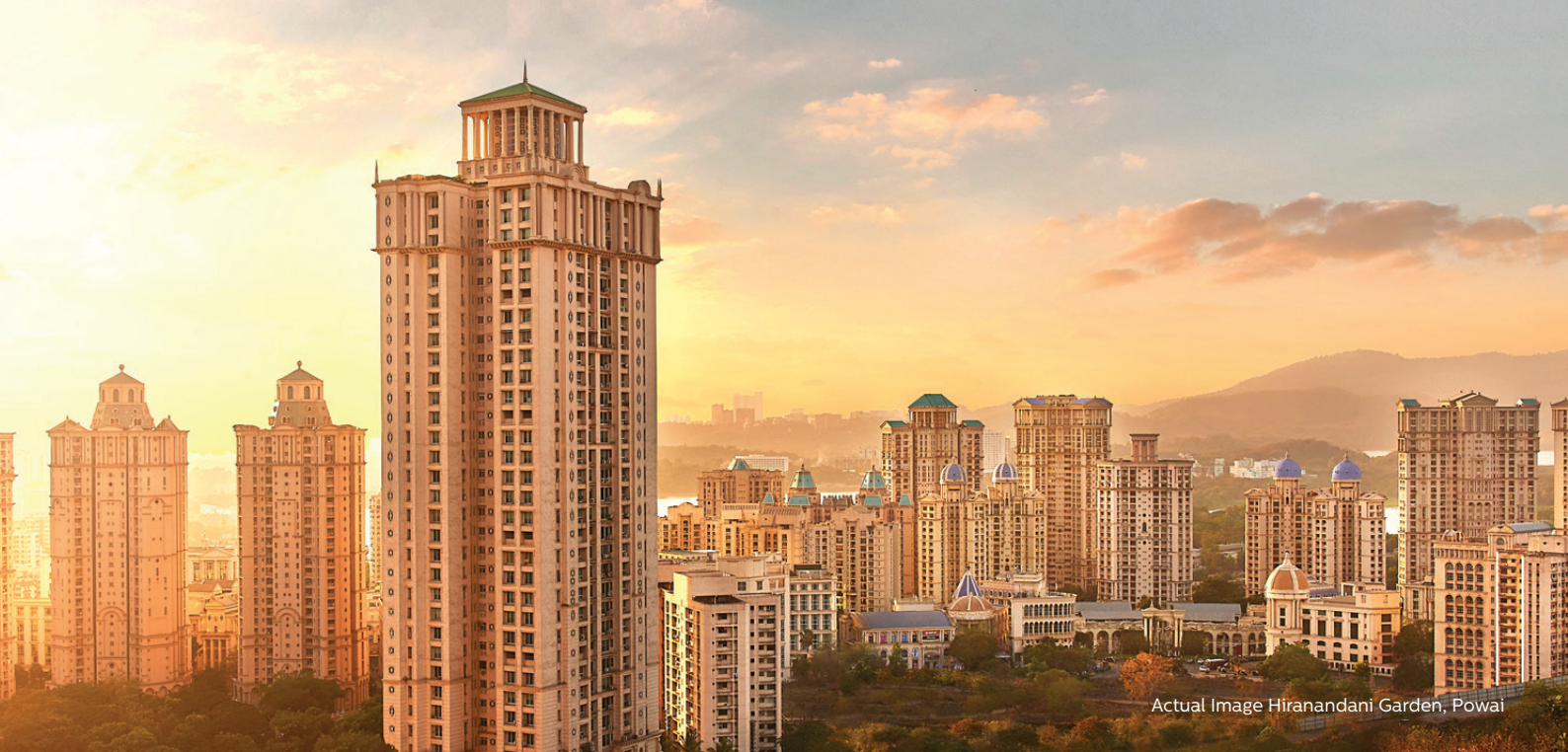
Actual Image Hiranandani Garden, Powai