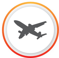
AEROSPACE Mahindra Aerospace