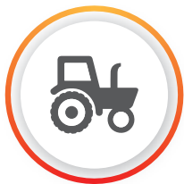
TRACTOR Mahindra & Mahindra Ltd.

Learn more about Mahindra on www.mahindra.com /Twitter and Facebook: @MahindraRise