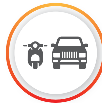
AUTOMOTIVE Mahindra CIE Automotive Ltd.