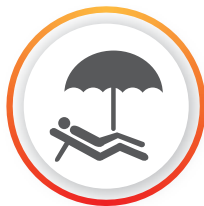
HOLIDAYS Mahindra Holidays & Resorts India Ltd.