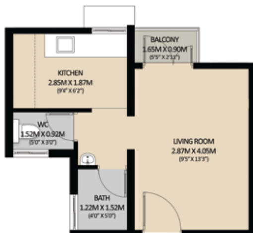
1 RK Unit Plan (Typical)