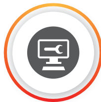
INFORMATION Technology Tech Mahindra Ltd.