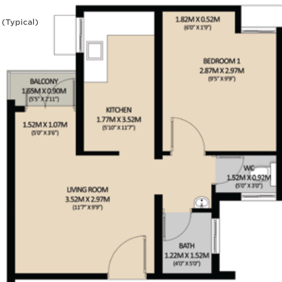
1 BHK Unit Plan (Typical)