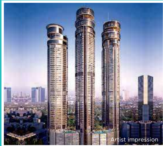
Omkar 1973 Worli