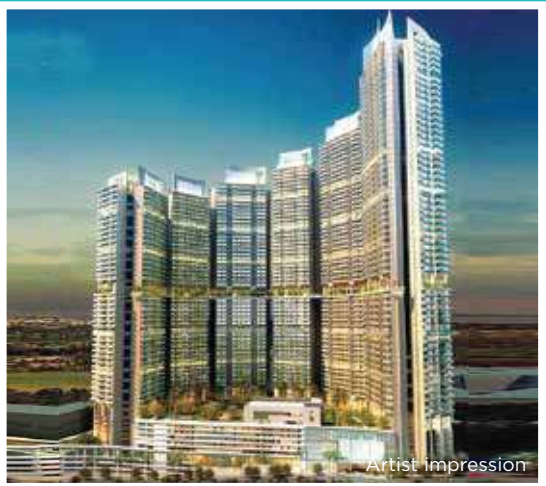
Crescent Bay, Parel