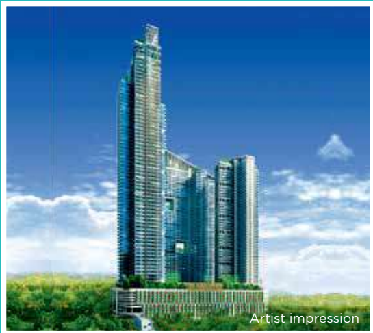
Omkar Alta Monte, Malad