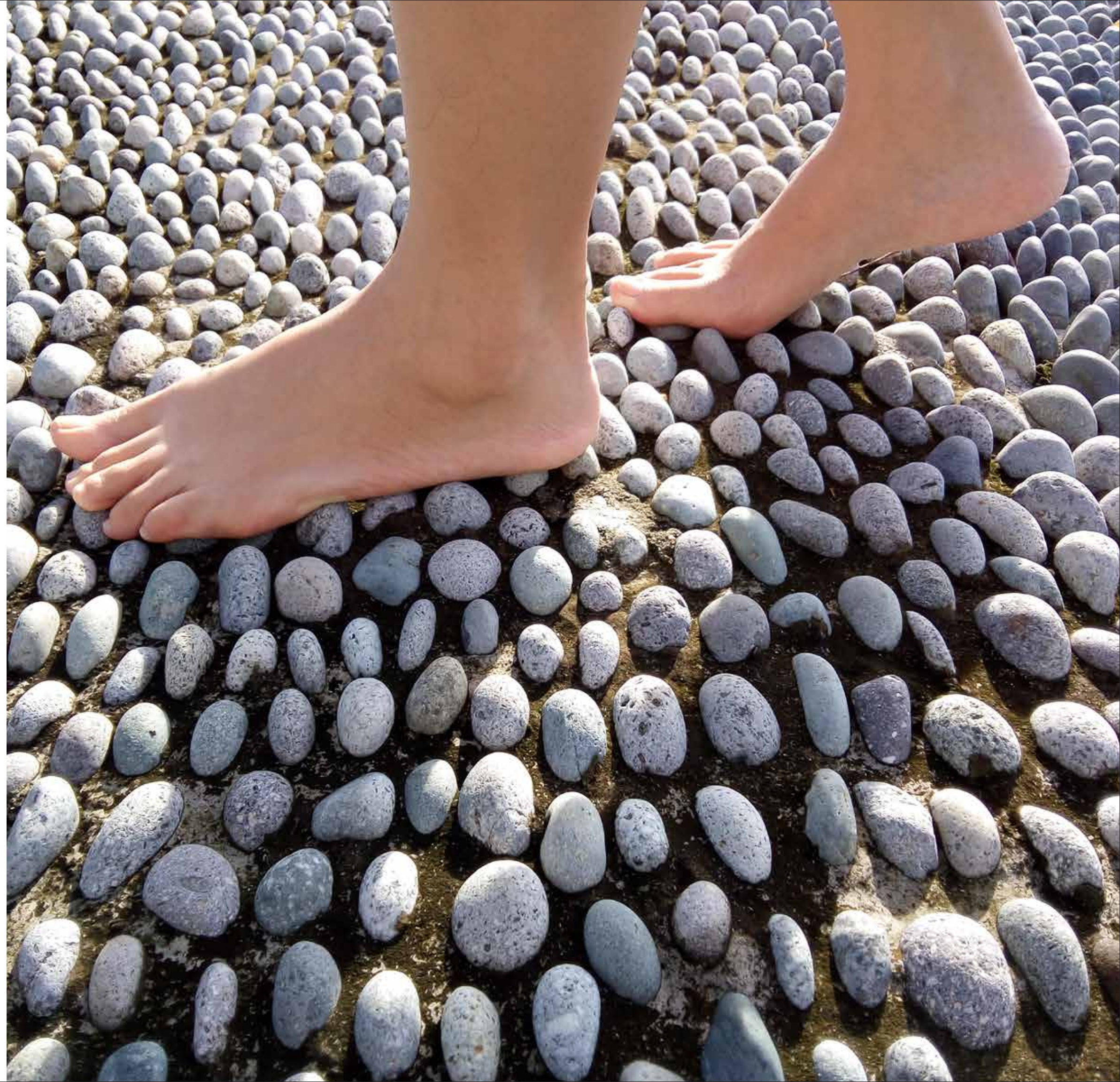
CALLS FOR A CELEBRATION