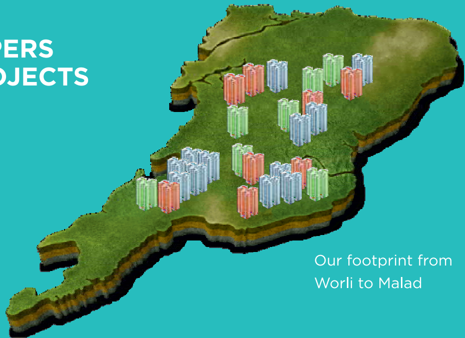
Our footprint from Worli to Malad

Additional 60 Mn. Sq. Ft. Upcoming Projects